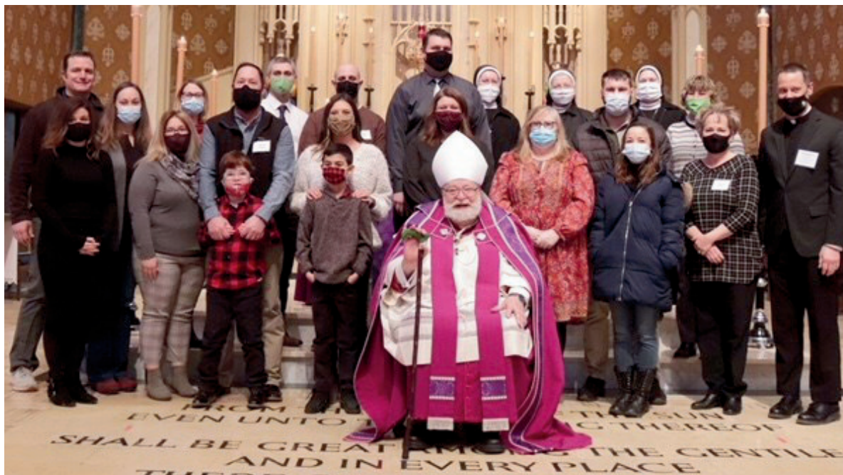
Rite of Election at the Cathedral