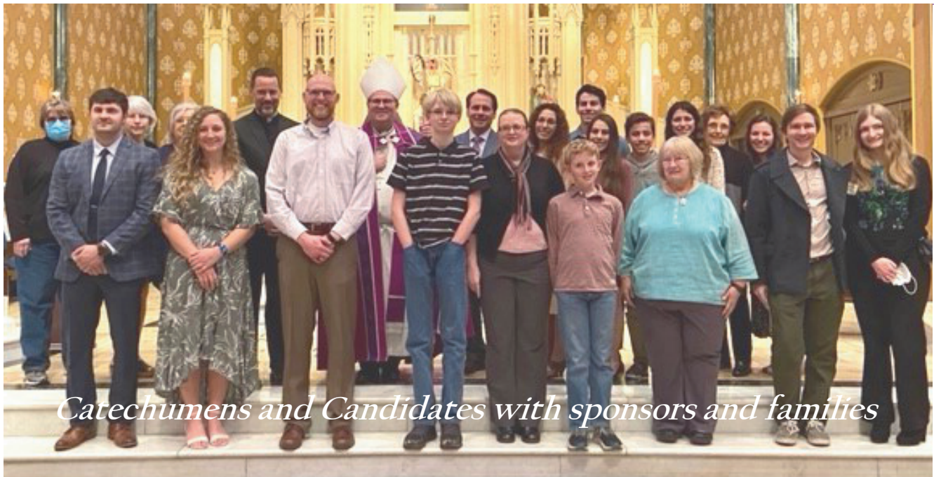
Catechumens and Candidates with sponsors and families