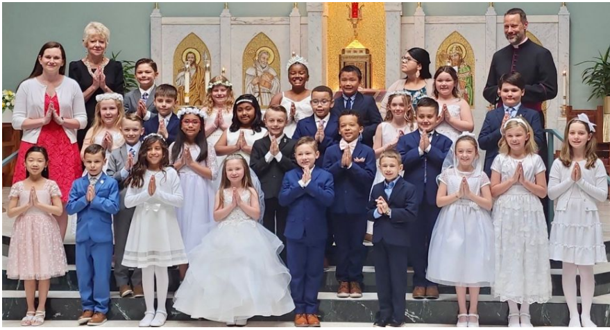
Congratulations on Your First Communion!