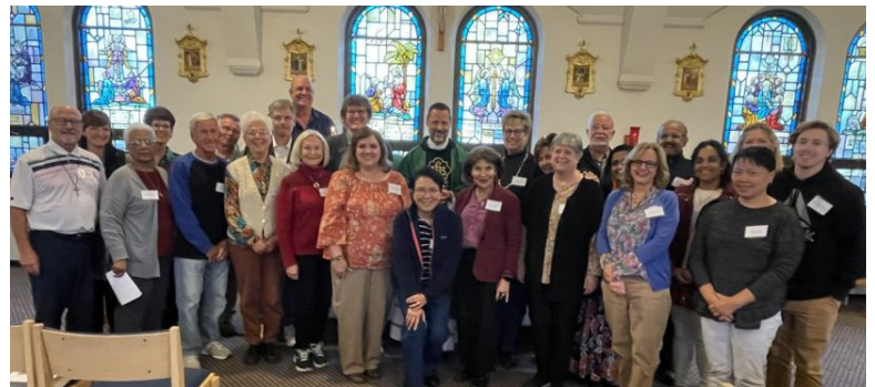
Our first Light of the World retreat was a wonderful experience of growing in relationship with Jesus and one another. Mark your calendar for our next one, February 23-26, 2024!