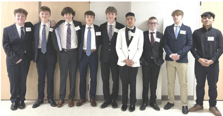
St Thomas the Apostle Confirmation Class of 2024