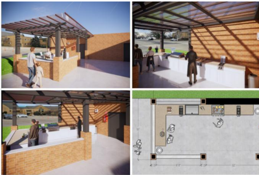
Were you at the Fish Fry? The Men's Club is raising funds for an outdoor kitchen for St. Thomas. Funds from the Fish Fry will go toward this project. Above are artist renderings of proposed kitchen.