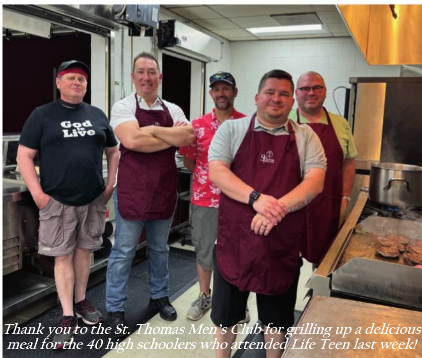
Thank you to the St. Thomas Men's Club for grilling up a delicious meal for the 40 high schoolers who attended Life Teen last week!